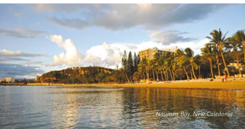
Noumea Bay, New Caledonia

Next time you are holidaying in New Caledonia ask for Allandale wine. We are excited to have recently increased our export market to this stunning island destination.